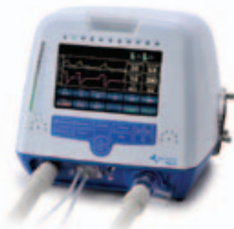
Flight 60 ventilator now distributed in the US by Maquet.

Intuitive and easy to use , Flight 60 provides continuity of care with high-acuity ventilators in one small package—delivering superior performance for both pediatric and adult patients outside of the ICU. It offers invasive and non-invasive capabilities along with comprehensive monitoring tools and advanced modes, including B-Lev (APRV) and Volume Guarantee. With 12-hours of battery operation and a wall-gas independent design, Flight 60 takes ICU-quality ventilation wherever you need it.