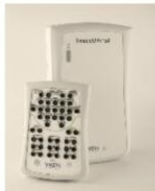
SomnoStar® 8.1 and z4 Amp